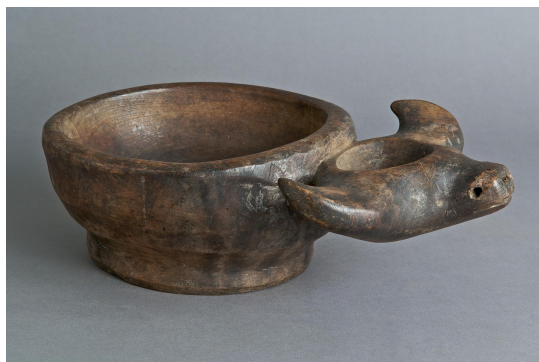
Image: Unrecorded Philippines artist, Bowl with Cow's Head Handle , Yale University Art Gallery

Japan is not only home to the largest and, by some measures, most livable, city in the world today, but also it boasts one of the richest archives for the study of urban history. The Urban Japan Workshop offers graduate students and advanced undergraduates the opportunity to explore the rich scholarly literature on Japanese cities across time, while also developing their own individual research projects.