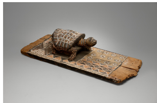
Image: Unrecorded Nkanu artist, Architectural Panel with Tortoise (20th century), Yale University Art Gallery

Cities of empire, both imperial capitals and colonial outposts, played crucial roles in the reinforcement of racial hierarchies, the flow of goods, people, and capital, and the representation of imperial power. This course looks at histories of cities around the world in the age of empire, and how they were shaped by these forces. Students gain visual analysis and mapping skills, and learn about the history and theory of imperial, colonial and postcolonial cities, and how they still inform debates over the urban environment today.