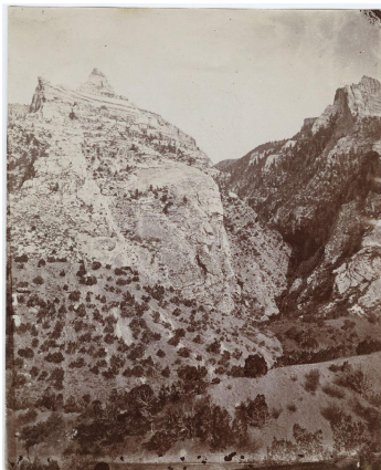
Image: E.O. Beaman, [Photograph of a Colorado Landscape] (ca. 1871), Beinecke Rare Book and Manuscript Library

present, and to move them to action for the future. These individual and collective memories of who and where they are, and the traumas, successes, failures, and accomplishments that they have with regard to school and education are essential to understanding how schools and school reforms work. Grounded in four different geographies, this course examines how the interrelationships of place, race, and memory are implicated in reforms of preK-12 schools in the United States. The course uses an interdisciplinary approach to study these phenomena, borrowing from commensurate frameworks in sociology, anthropology, political science, and memory studies with the goal of examining multiple angles and perspectives on a given issue. EDST 110 recommended.