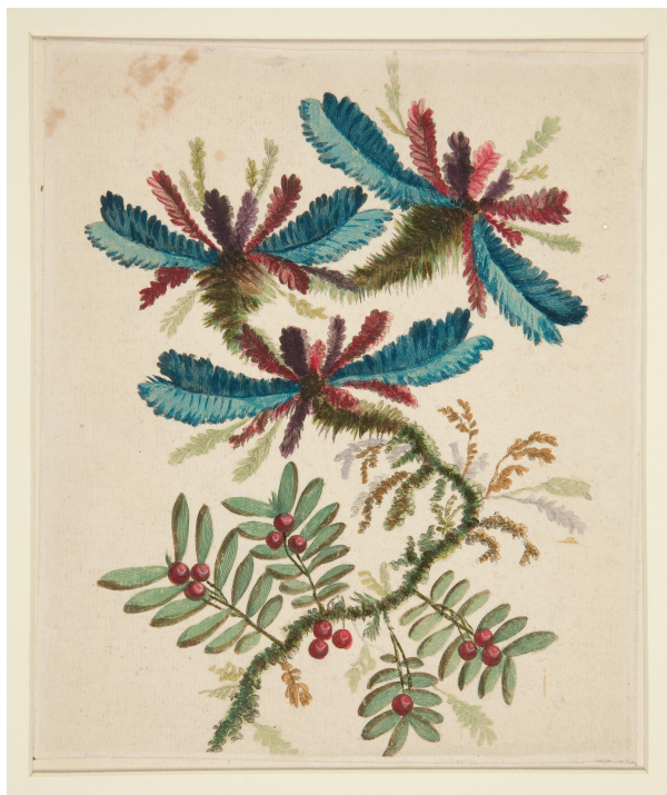
Image: Jean Baptiste Pillement, Fantastic Flowers (ca. 1795), Yale University Art Gallery

The seminar explores the origins and developments of Japanese spatial concepts and surveys how they help form the contemporary architecture, ways of life, and cities of the country. Many Japanese spatial concepts, such as ma , are about creating time-space distances and relationship between objects, people, space, and experiences. These concepts go beyond the fabric of a built structure and encompass architecture, landscape, and city. Each class is designed around one or two Japanese words that signify particular design concepts. Each week, a lecture on the word(s) with its design features, backgrounds, historical examples, and contemporary application is followed by student discussion. Contemporary works studied include those by Maki, Isozaki, Ando, Ito, SANAA, and Fujimoto. The urbanism and landscape of Tokyo and Kyoto are discussed. Students are required to make in-class presentations and write a final paper. Limited enrollment.