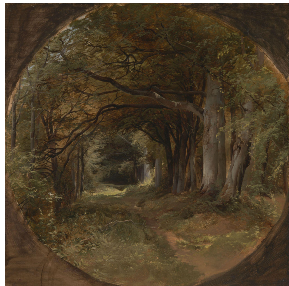
Image: John Middleton, Landscape (ca. 1850), Yale Center for British Art

ince the mid-twentieth century, the drive for nuclear power—in the form of weapons and energy—has irreversibly shaped the landscapes of the North American continent, and the world. The activities of the nuclear fuel cycle (uranium mining and milling, weapons testing and production, and radioactive waste dumping) have reached every state in the country, often in devastating and uneven ways. Today, debates about nuclear weapons and the benefits of nuclear power are at the forefront of contemporary discourse. This course contextualizes these impacts and debates in the long history of post-war industrialization and militarization, a history that begins with 19th century settler-colonial conceptions of “wilderness.” Throughout the course, we investigate how cultural imaginaries of wilderness (and ideas about nature, landscape, space, and environment) are deeply related to the uneven geographies of the nuclear industrial complex, and the intersections of US imperialism, militarism, extractive capitalism, and environmental racism. Alongside this, we consider how artists, activists, and scholars are working to theorize, reframe, and reimagine the legacies of the nuclear industry.