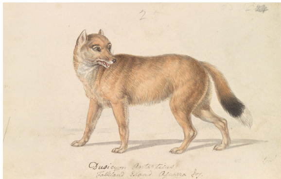
Image: Charles Hamilton Smith, Falkland Islands Wolf (ca. 1837), Yale Center for British Art