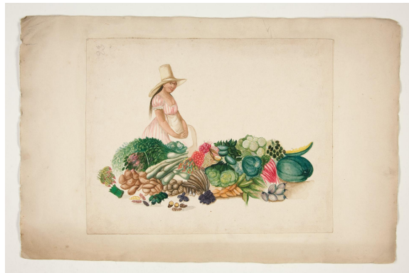
Image: Woman with Fruit and Cabbage on Plaza de Lima (ca. 1850), possibly by Pancho (Francisco) Fierro, Yale University Art Gallery

"White space" is a perceptual category that assumes a particular space to be predominantly white, one where black people are typically unexpected, marginalized when present, and made to feel unwelcome—a space that blacks perceive to be informally "off-limits" to people like them and where on occasion they encounter racialized disrespect and other forms of resistance. This course explores the challenge black people face when managing their lives in this white space.