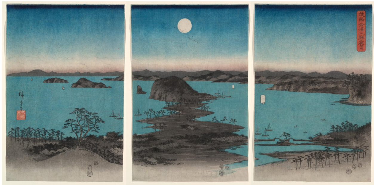
Utagawa Hiroshige, Kanazawa in Moonlight, from the series Eight Views of Musashi Province (1857), Yale University Art Gallery