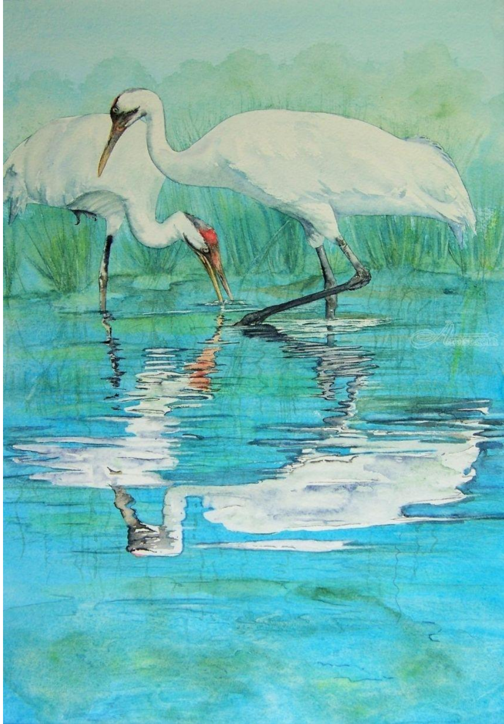
Blue Bayou - Vicky Lilla (2015)